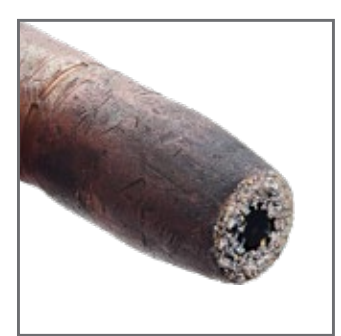
STANDARD OEM NOZZLE Fully Clogged