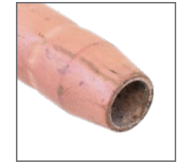
E-WELD PRE-COATED NOZZLES™

Video available at The Walter Network www.youtube.com/user/TheWalterNetwork