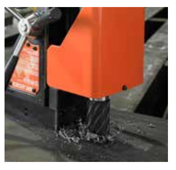
For larger hole, ½" and above, use magnetic base with standard Weldon shank

Comes in a foam protected casing for for the ultimate machine protection