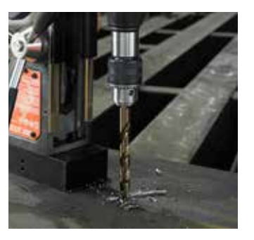
Includes a ½" chuck adaptor for small hole drilling