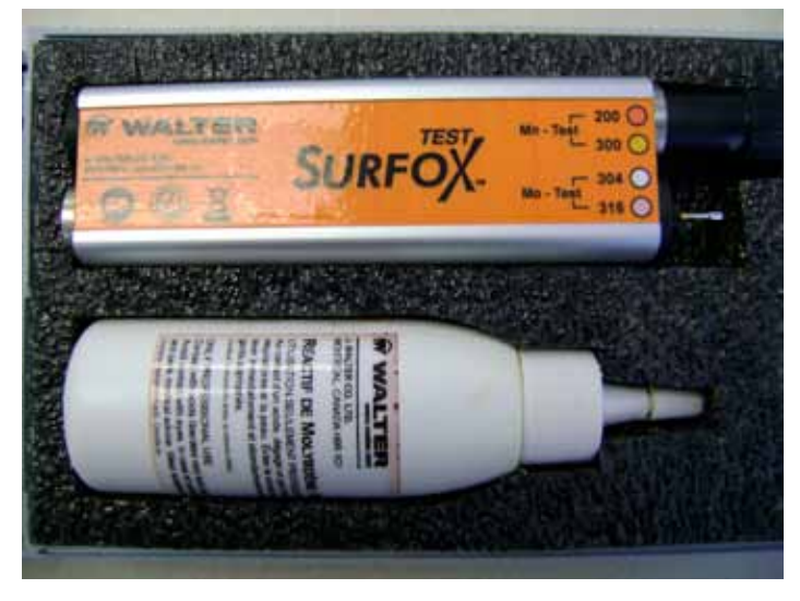
Probe and Molybdenum reagent. The Manganese reagent is inside the probe. Current is passed through the chemical solution which reacts with the surface colouring the test papers depending on the composition of the alloy.

There are countless types of stainless steel. They are mainly regrouped in 3 categories or grades: 200, 300 and 400. Each grade has its own specific properties directly linked to its chemical composition. Type 304 and 316 are the most commonly used alloys in industry. The main difference between the two being the addition of Molybdenum (Mo) in 316 grade. The addition of Mo increases the corrosion resistance of this alloy. The main difference between 200 and 300 grade is the higher percentage of Manganese (Mn) in the 200 grade family of alloys.